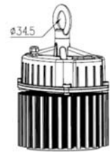
Fig. 1 Suspension ring eye location